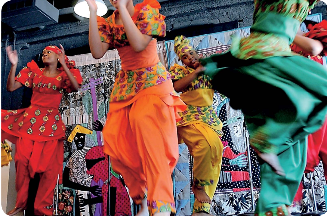
African dances are part of Kwanzaa celebrations.

Kwanzaa (say kwan-za ) is a world celebration of African culture . It is held for one week in December. Kwanzaa is celebrated in countries with large numbers of African people.