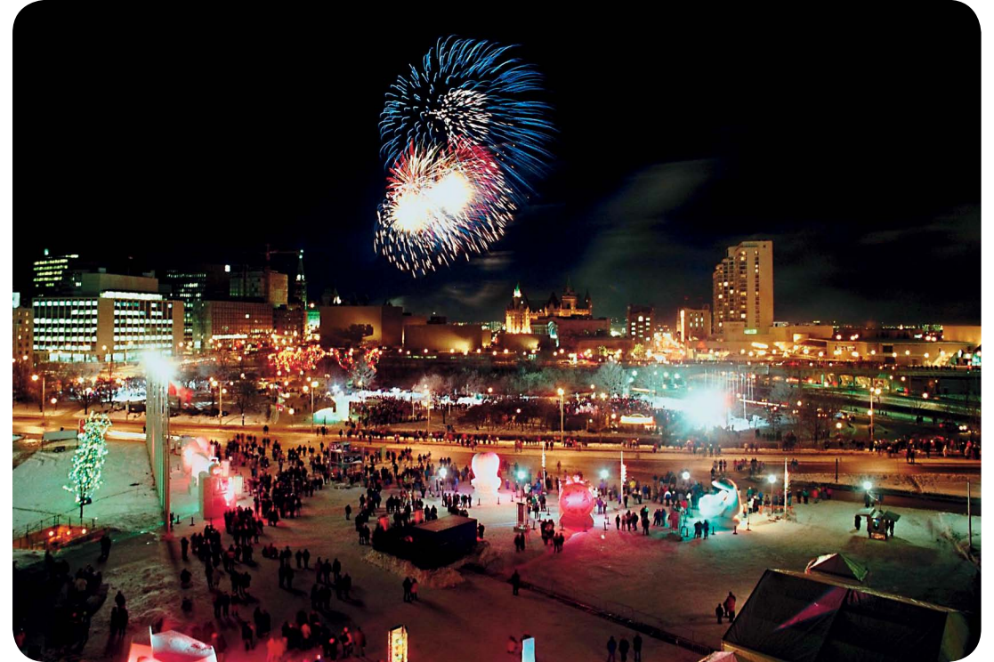
New Year's Eve is celebrated all around the world with fireworks.

Some celebrations involve only a few people. Others involve whole cities or countries. Large celebrations take place across the world.