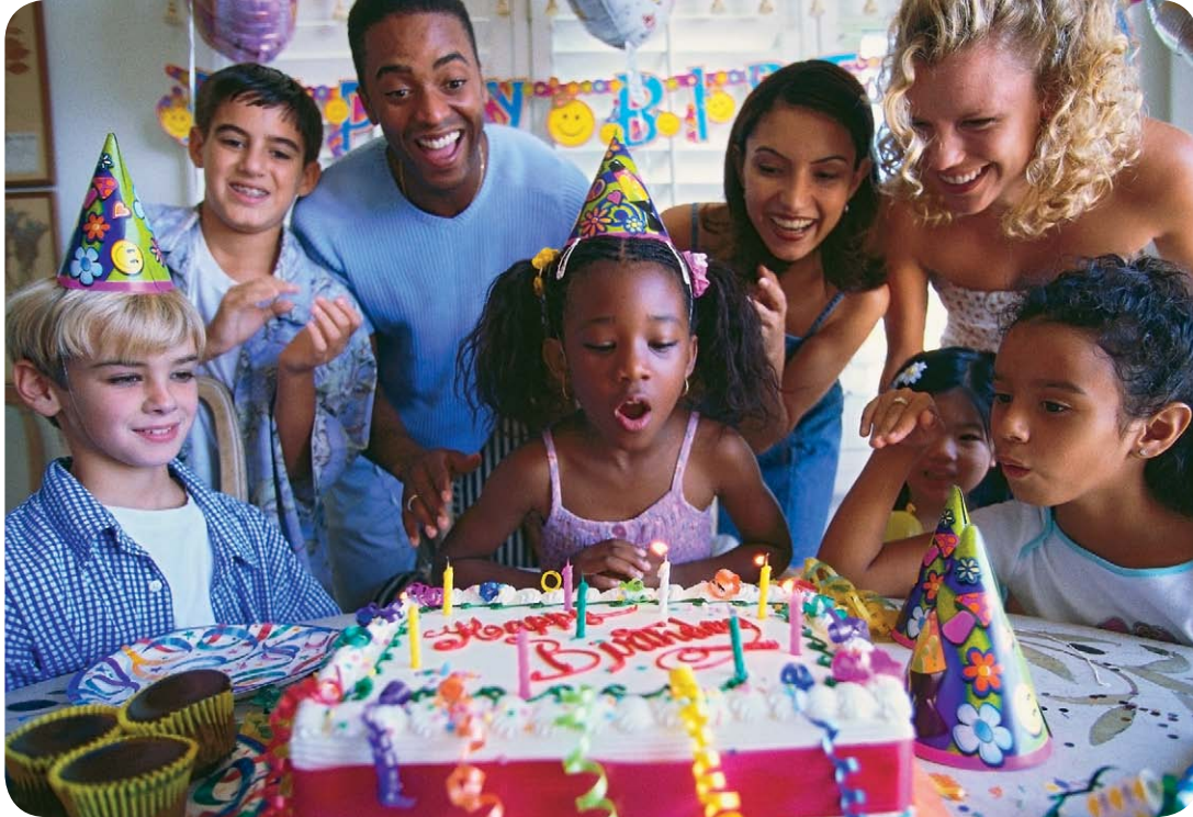
Birthdays are special events that many people celebrate.

Celebrations are events that are held on special occasions. Some are events from the past that are still celebrated. Others celebrate important times in our lives, or activities such as music.