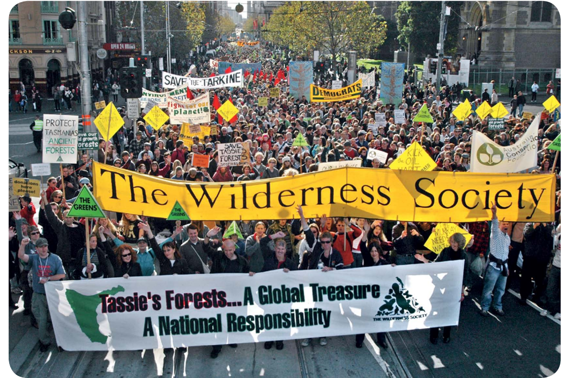
Thousands of people take part in rallies on World Environment Day.

Each year the celebrations are held in a different city. People from all over the world attend. There are large meetings and other special activities, such as rallies and concerts.