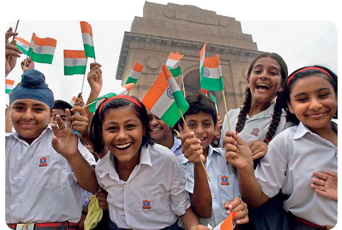
School students wave the Indian flag on Independence Day.

Schools are open on Independence Day. Students take part in ceremonies and learn about India's independence. They also sing the Indian national anthem.