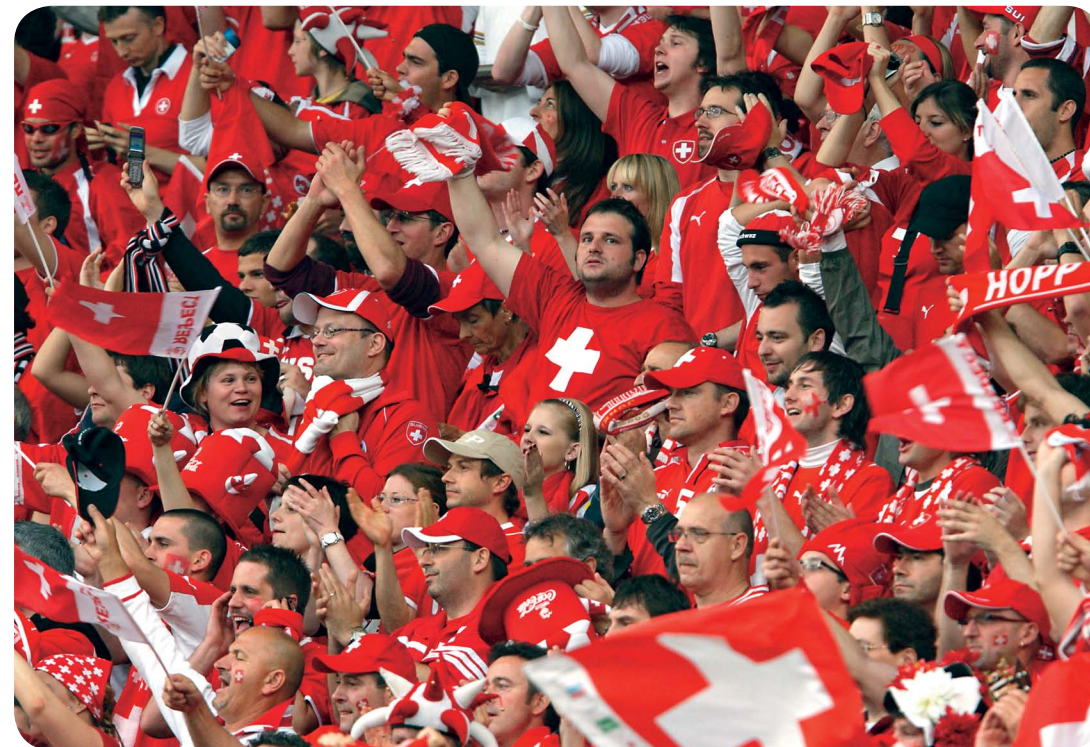
Fans of the winning team cheer loudly at the Football World Cup.

Many players and visitors come from around the world to join in the celebration. Millions of people also watch the Football World Cup on television.