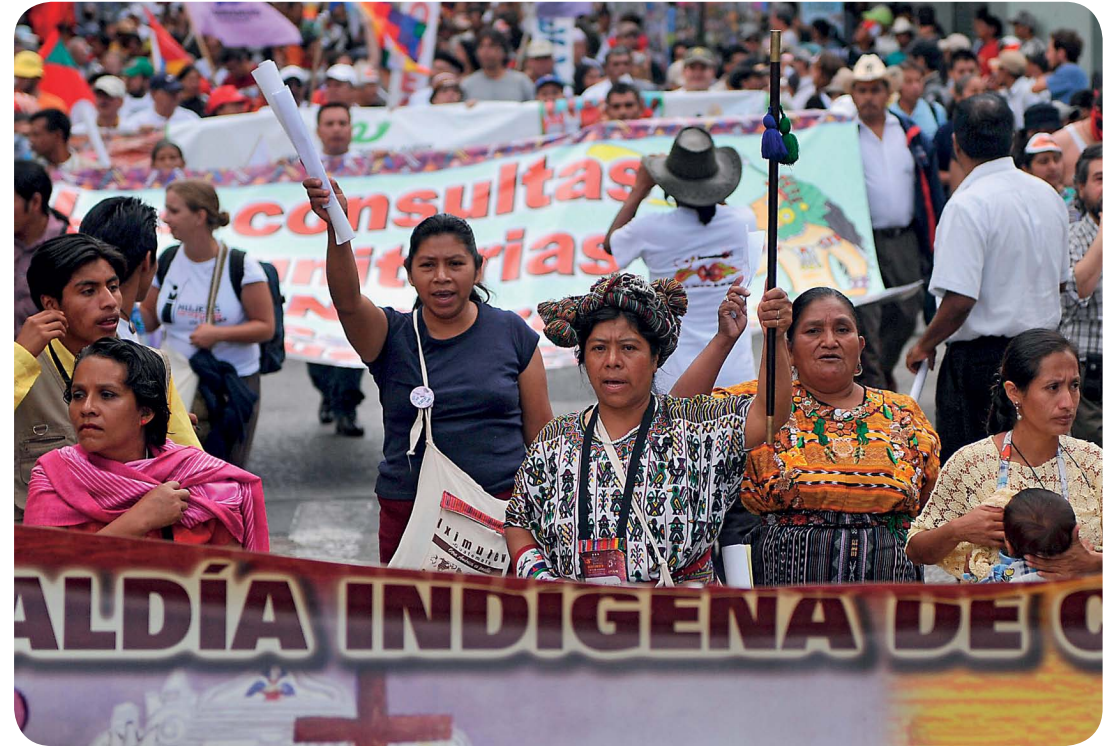
Some Indigenous people of the Americas hold separate events on Columbus Day.

Many Indigenous people of the Americas do not celebrate Columbus Day. This is because they believe their people were treated unfairly after Columbus arrived.