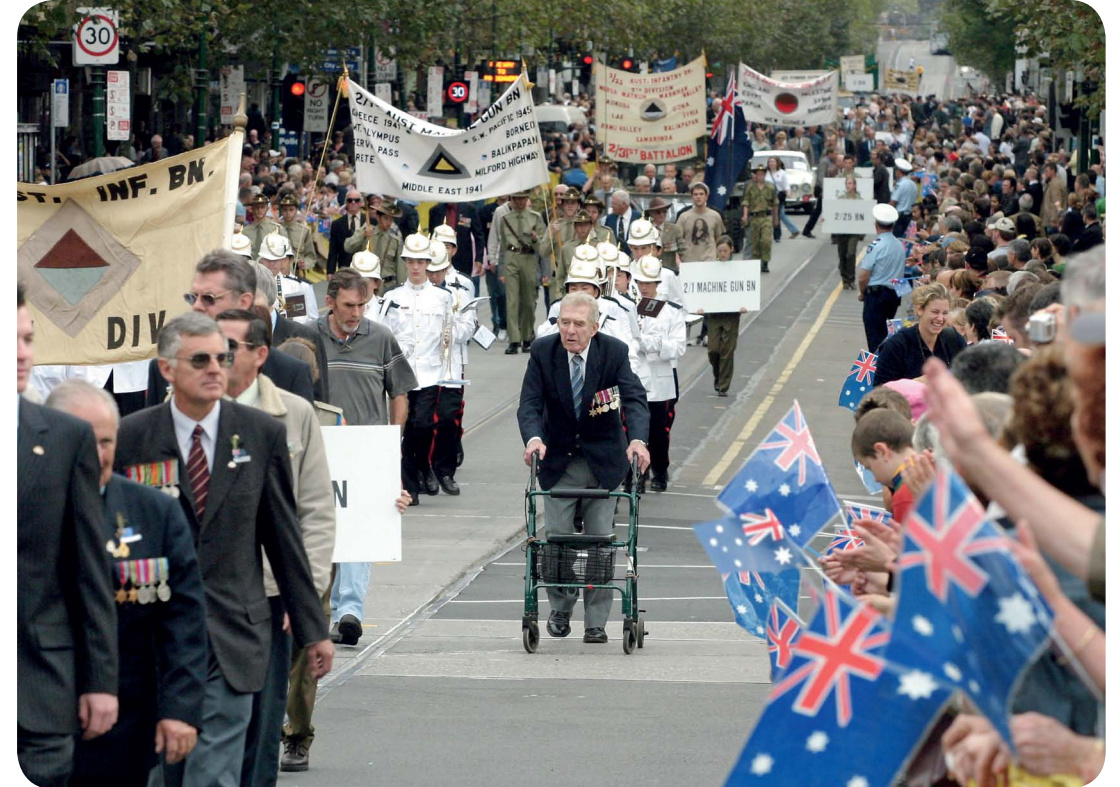
Parades are a very important part of Anzac Day.

On Anzac Day members of the military take part in parades. There are also special acts to remember those killed or injured. These include laying wreaths at war memorials .