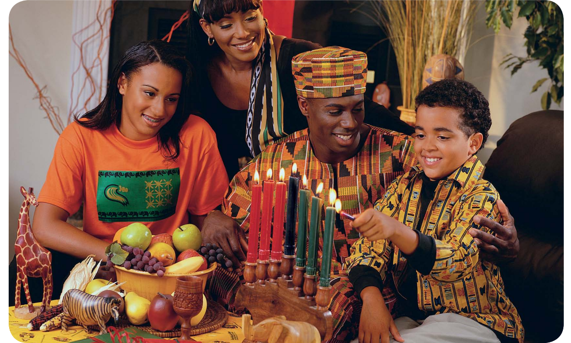
Seven candles are lit during Kwanzaa week – one for each day of the celebration.

Kwanzaa started in America in 1966, but has spread to many other countries. During the week people have large feasts and give presents.