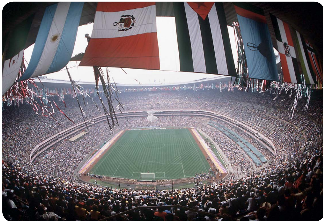
Hundreds of thousands of people watch Football World Cup matches.

The Football World Cup is a big sports competition. It is held every four years in a different country. The Football World Cup usually lasts for one month.