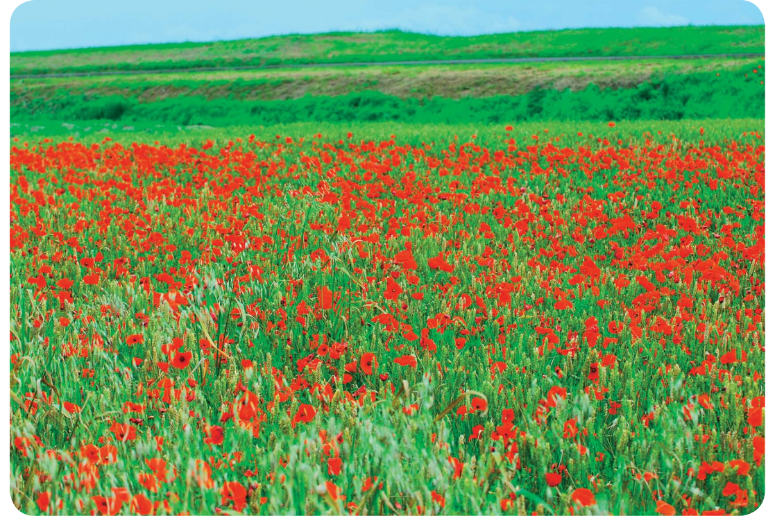
On Remembrance Day, poppies are used to show respect for people killed at war.

On Remembrance Day people wear poppies as a sign of remembrance. Poppies grew on the battlefields in Europe during World War I.