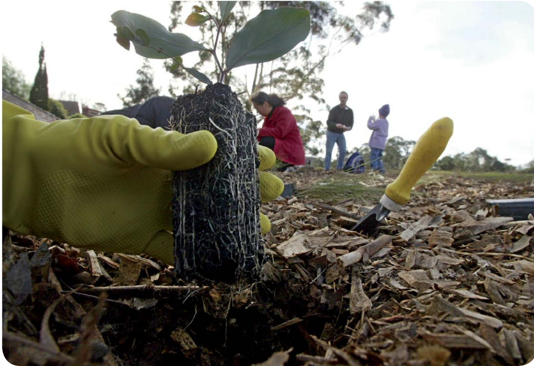
Tree planting takes place all around the world on World Environment Day.

World Environment Day is held every year on 5 June. It teaches people about caring for the environment. An organisation called the United Nations started the day in 1972.