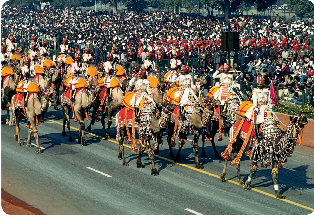
Large crowds watch the parades on Indian Independence Day.

India celebrates its independence from Britain on 15 August every year. The Prime Minister gives a speech to the Indian people. There are also flag-raising ceremonies and parades.