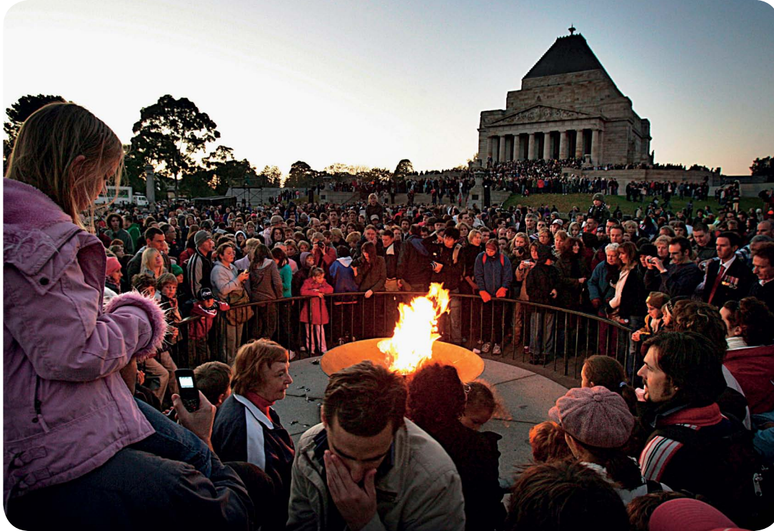
On Anzac Day, people go to dawn services to remember those who died in wars.

Anzac Day is held in Australia, New Zealand and some Pacific islands. It is held each year on 25 April. This was when Anzac soldiers landed at Gallipoli, Turkey, in 1915.