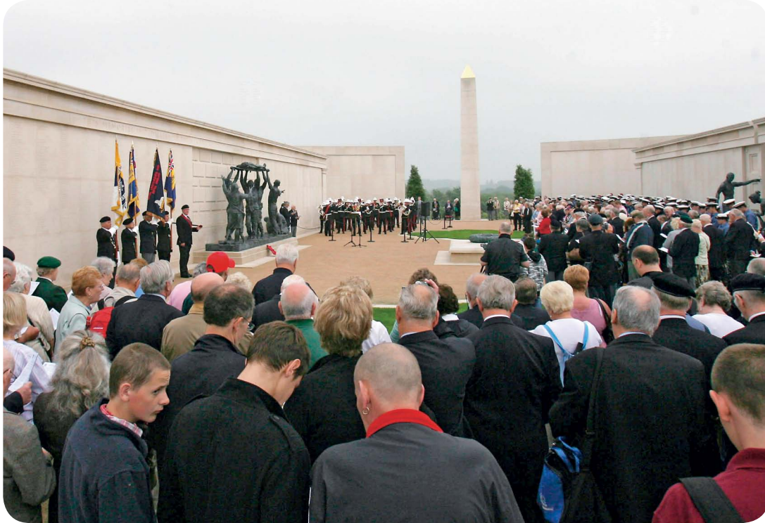
People are silent for two minutes at 11 am on Remembrance Day.

Remembrance Day is held in many countries on 11 November each year. This was the day World War I ended in 1918. Remembrance Day ceremonies honour people killed in wars.